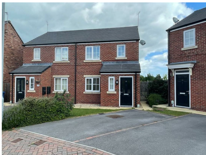
Front External - Parking